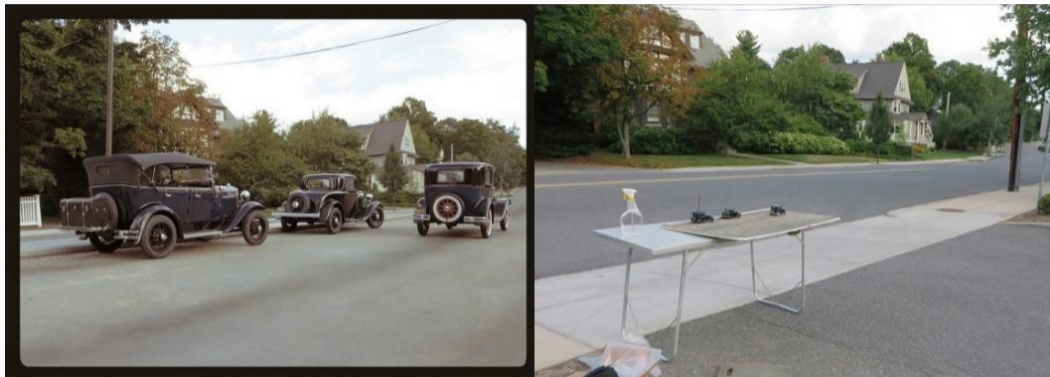
Figure 1: Fairness is a matter of perspective