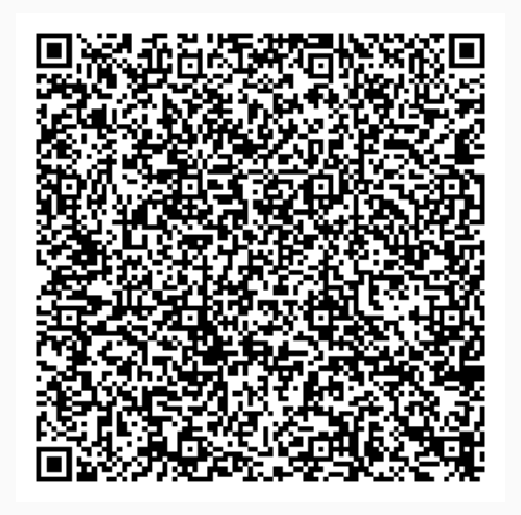
Figure 1: Scan this QR-code to obtain Dr. De Brouwer's business card and connect via